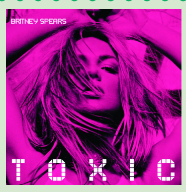
1. "Toxic" by Britney Spears