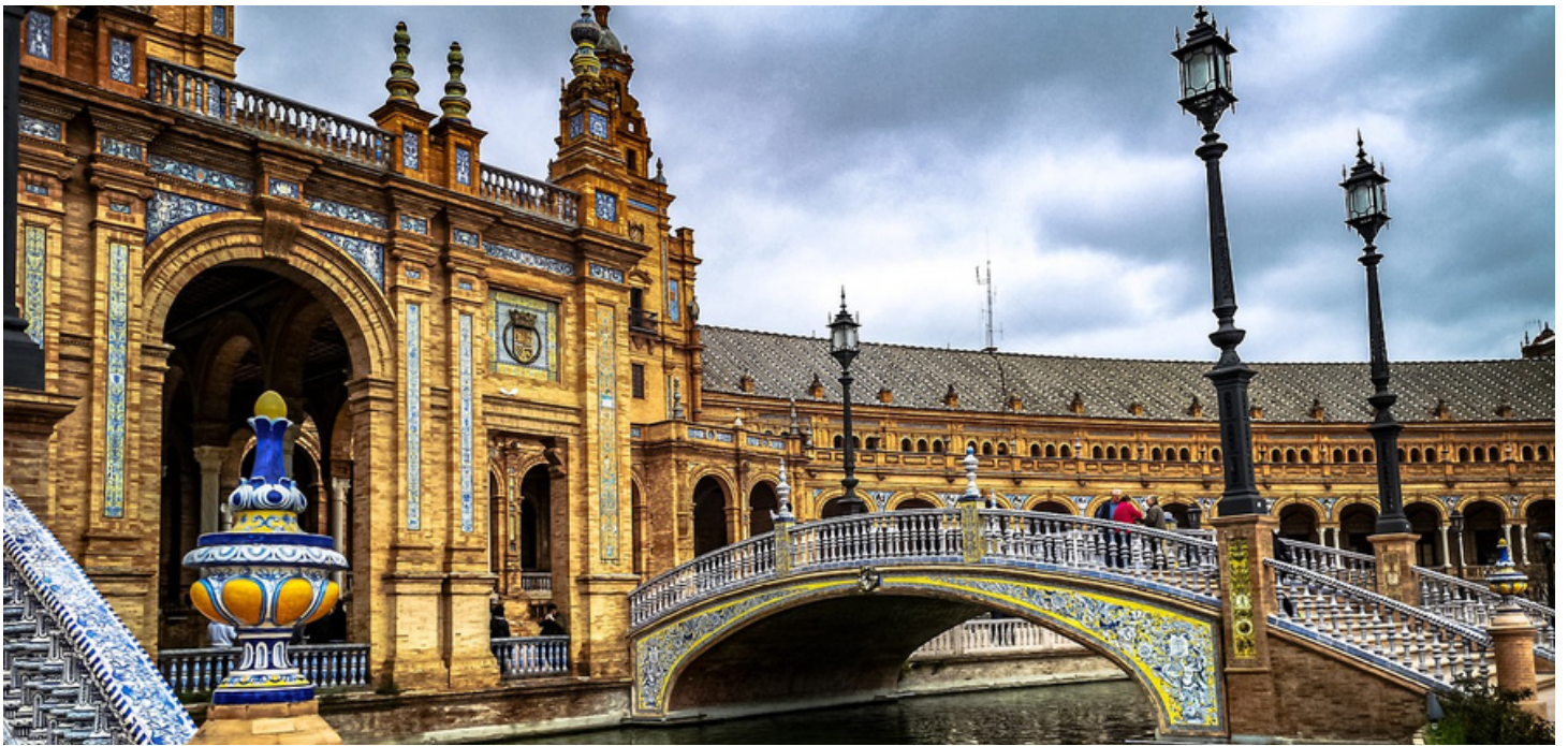
Plaza España (Sevilla).