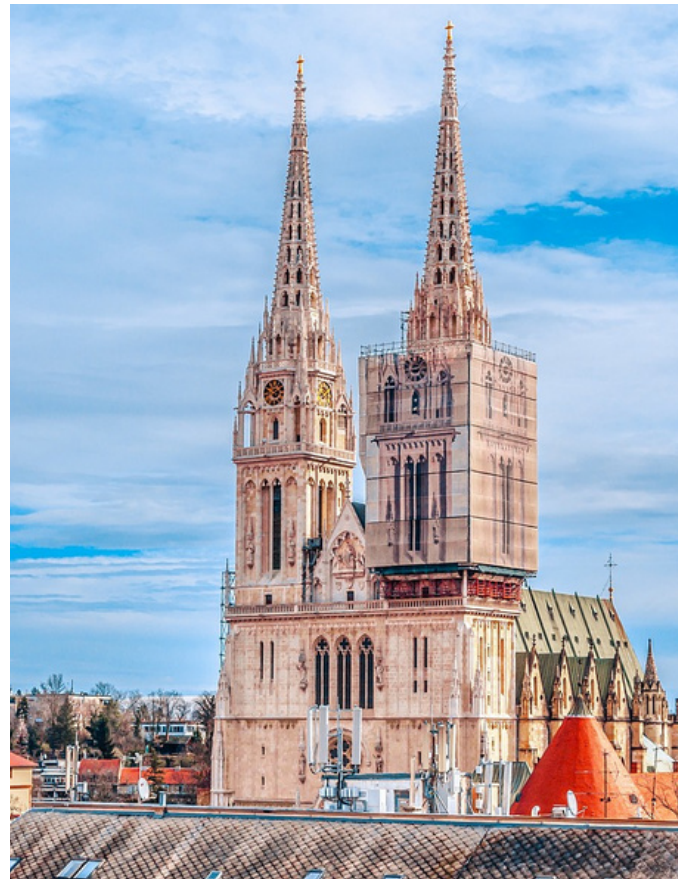
Zagreb Cathedral.

I would like to thank Mreža udruga Zagor team for this opportunity and for the great welcome we have received.