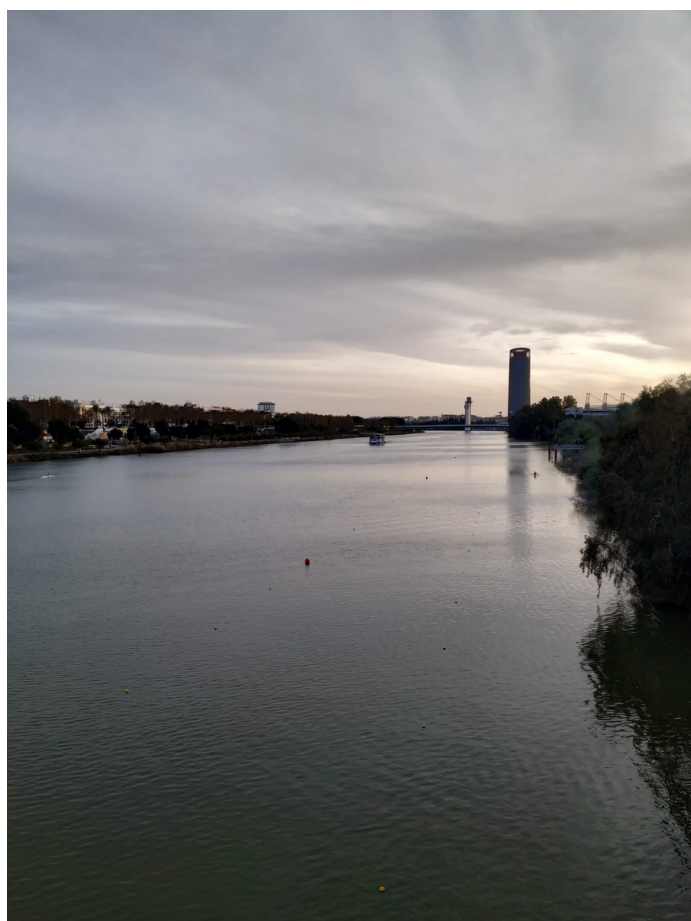
Guadalquivir River at Seville.

As I said at the beginning, the welcome has been very hospitable and I hope to repay the organization and the city for all the trust placed in me.