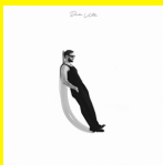
4. "Due vite" by Marco Mengoni