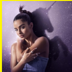
3. "Unicorn" by Noa Kirel