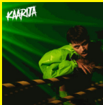
2. "Cha Cha Cha" by Käärijä