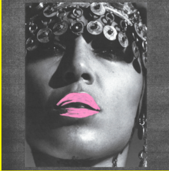
1. "Tattoo" by Loreen