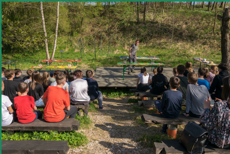
Autor: Tomica Forko

Ponukani velikim interesom javnosti, Park je svoje eksponate proširio cijelom Hrvatskom, od Vukovara do Dubrovnika, a svi se eksponati na jednom mjestu nalaze u Mokricama pored Oroslavja u Parku znanosti koji je otvoren 2018. godine. Od tada Park bilježi sve veći interes posjetitelja te je s početnih petnaest tisuća posjetitelje dosegao brojku od trideset i pet tisuća u 2022. godini. Povećanjem opsega djelatnosti, redovima Parka pridružuju se Matija i Tomica te se idejama i radom priključuju Luki. Kreiranjem novih projekata i veće mobilnosti Parka, 2022. godine kreće i Park znanosti na kotačima, mobilna verzija kojim Park putuje i u vaše mjesto, školu, događaje... Stručnim vodstvom, opuštenim pristupom i radionicama ovaj trojac stvara “magiju” iz fizike, a strašnog “zmaja” matematiku pretvara u zabavno i pristupačno iskustvo.